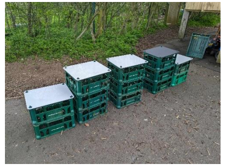
And the following day......they were a HUGE SUCCESS!